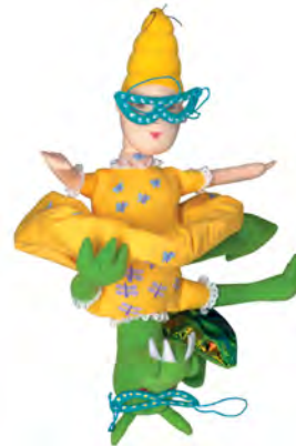
The Library Dragon FlipDoll

Doll | $34.95 ISBN: 978-1-56145-267-5 Book & Doll | $52.00 ISBN: 978-1-56145-585-7