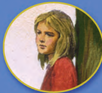
GEORGIA BOOK 4