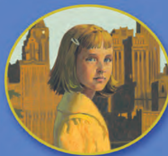
DANA BOOK 2

Friendship and family. Life and death. Four girls.