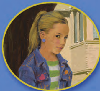
FRANCIE BOOK 3