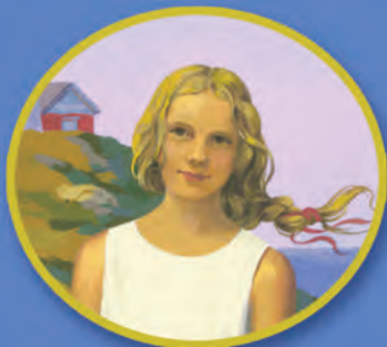
ABBY BOOK 1

Friendship and family. Life and death. Four girls.