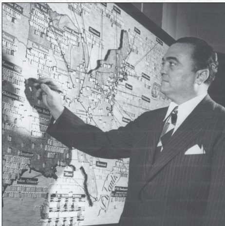
Hoover mapping the network of his offices

J. Edgar Hoover was the FBI's first director. In this unsparing exploration of one of the most powerful Americans of the twentieth century, accomplished historian Marc Aronson unmaskes the man behind the Bureau—his tangled family history and personal relationships; his own need for secrecy, deceit, and control; and the broad trends in American society that shaped his world. Using photographs, cartoons, movie posters, and FBI transcripts, Master of Deceit helps readers to understand Hoover's motives and the political climate of the United States in the twentieth century.