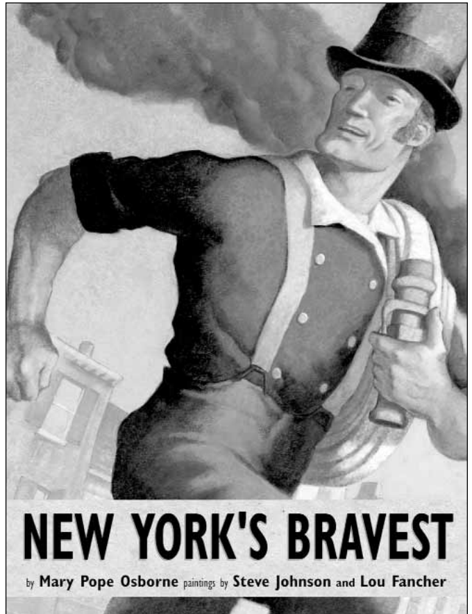
Alfred A. Knopf hardcover • 0-375-82196-1

Tall Tales • Literature Study Characterization • Use of Language Grades 2–6