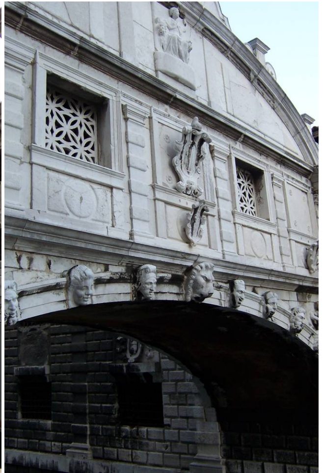
The Bridge of Sighs, which prisoners crossed on the way to their cells