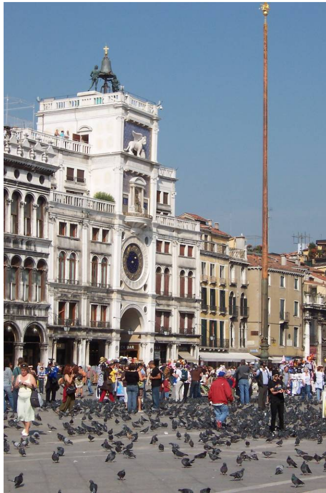
Clock tower with winged lion and bell