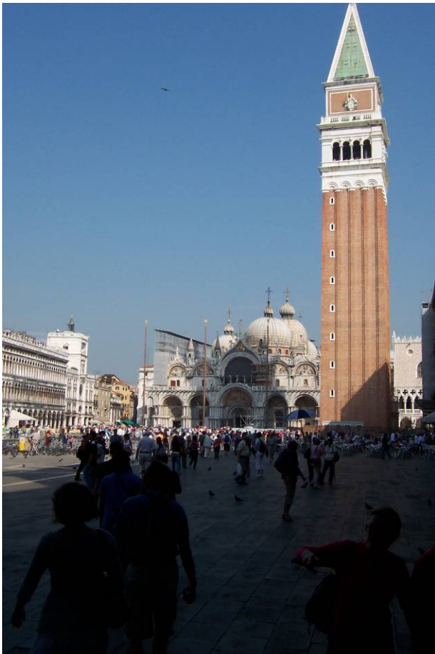
Saint Mark's Square