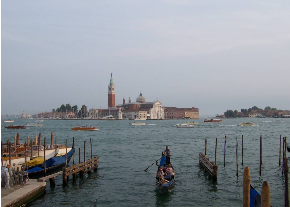
A view of Venice across the lagoon

See some of the same sights that Jack and Annie saw in the book!