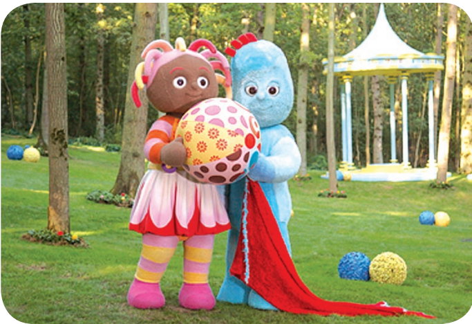
Playing with the ball