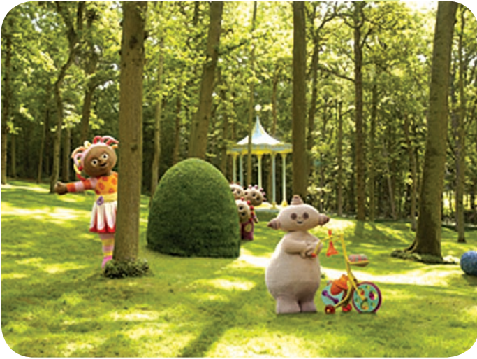
Hide and Seek

Use these story scenes with your child for quiet-time play. Talk with your child and discuss what they think could happen in each scene. Then ask them questions to spark new ideas and strengthen your child's vocabulary and storytelling skills.