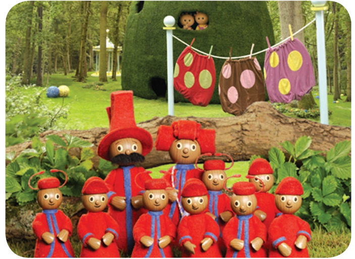
The Pontipines and the Tombliboos