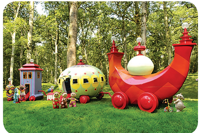
All aboard the Ninky Nonk

Visit the magical world of In the Night Garden on the Hub. Check local listings or visit www.hubhub.com . And learn more about us at www.inthenightgarden.com .