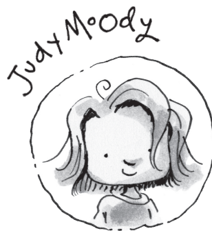
Bookworm, speed-reader (NOT!), and quizzard

At the beginning of the book are illustrations and short biographies of major characters. Have your students create their own Who's Who pictures and bios of their family, friends, teammates, and/or classmates. Go over the format of the Who's Who pages in Judy Moody, Book Quiz Whiz with your class to point out the quirky, intricate illustrations and the short, to-the-point descriptions to inspire them. Invite students to share their creations with the class.