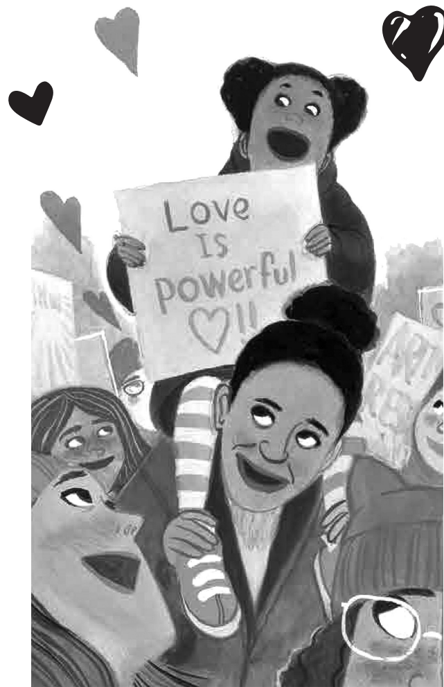
Illustrations 2020 © LeUyen Pham, courtesy of Candlewick Press

Notice the hearts. Where might the trail of hearts go next?