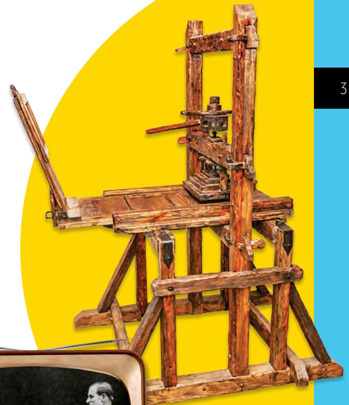
An early printing press