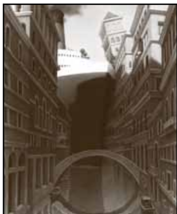
Even with her mighty engines in reverse, the ocean liner was pulled further and further into the canal.